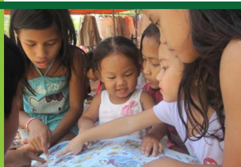
Volunteer team HAPI teaches children in the Philippines.

Volunteers logged 274 hours in Puerto Rico during a "Secular Spring Break" deployment for Hurricanes Irma and Maria held with All Hands and Hearts: Smart Response (AHAH) and Secular Student Alliance. We also partnered with AHAH for Hurricane Michael recovery in FL, where 9 volunteers worked 413 hours. We raised $22,536 for hurricane recovery in the Bahamas; $1,500 for Rohingya refugees hit by monsoons; and $7,265 for the US immigration crisis.