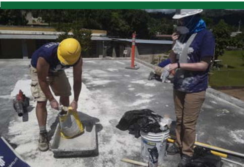
Volunteers work to rebuild hurricane-damaged homes in Puerto Rico.

After an extensive process to find a good fit for our program in Ghana's Cape Coast area, we started a partnership with Services and Advocacy for Persons with Intellectual Disabilities (SAPID), a school that supports area students with access to education and vocational training as well as campaigning to end discrimination. We also launched a partnership with the community of Wiamoah to start a tailoring vocational training project and selected 10 students to kick off the program.