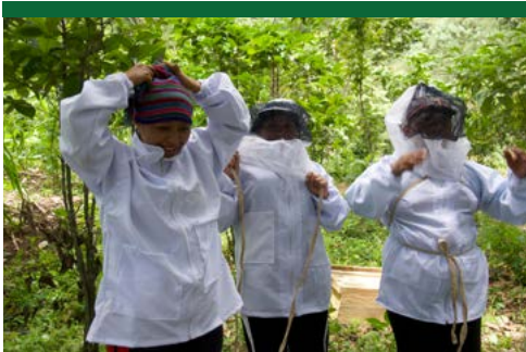
Pueblo a Pueblo supports farmers in undertaking cooperative beekeeping and honey production.

You fought (again) for asylum seekers denied due process at the Southern US border. You rebuilt hurricane-wrecked homes in Puerto Rico. You supported communities hit hardest by the worst disaster ever to strike The Bahamas, and the world's most vulnerable population — Rohingya refugees, as they were devastated by monsoons in Bangladesh. You expanded service in your hometowns. You helped our Ghana program forge local partnerships to empower stigmatized and disadvantaged residents. You supported FBB during a period of inward refinement and outward expansion, a macrocosm of humanists' belief in the inseparability of helping oneself and helping others.