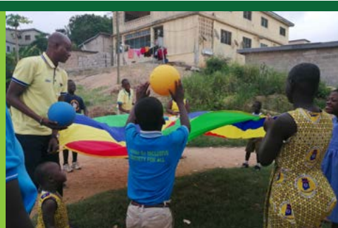
Students with intellectual disabilities learn and play at our partner school in Ghana.

We gave $111,900 to beneficiaries embodying humanist values. Grantees' work included support for journalists empirically covering gun violence; families needing legal services at the border; minority students studying STEM; and South African students affected by apartheid. The Compassionate Impact Grant went to Pueblo a Pueblo to provide Indigenous Guatemalan women and farmers with ecologically-sustainable practices that increase their income.